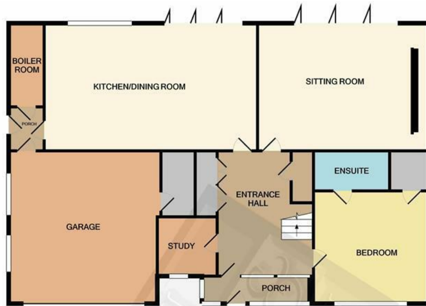
GROUND FLOOR APPROX. FLOOR AREA 1336 SQ.FT. (124.1 SQ.M.)