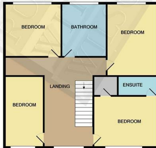
1ST FLOOR APPROX. FLOOR AREA 791 SQ.FT. (73.5 SQ.M.)

TOTAL APPROX. FLOOR AREA 2127 SQ.FT. (197.6 SQ.M.)